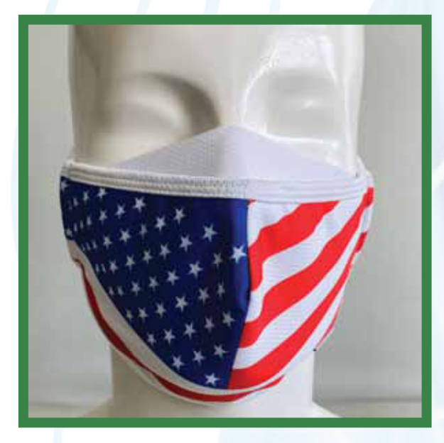
Sublimation is custom colors throughout, other than the outer edges and straps (limited to white or black).