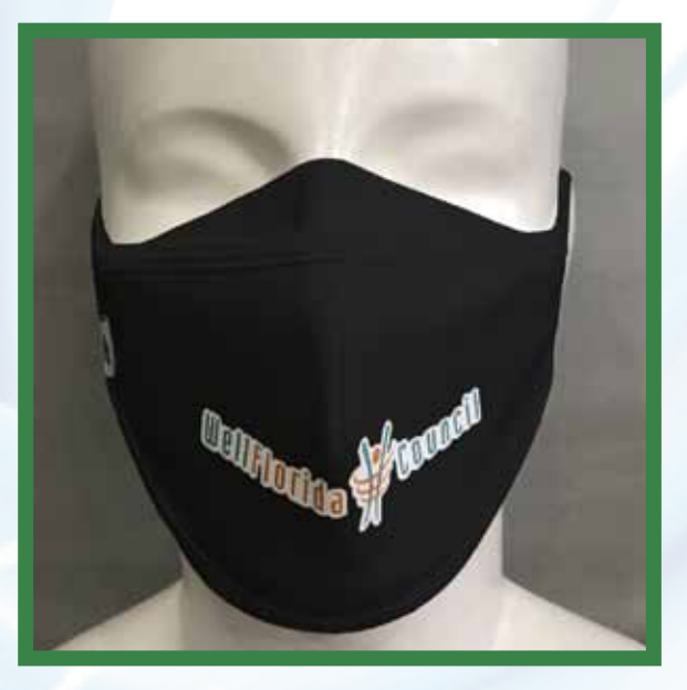
Heat transfer is one location only, white or black mask.

100% polyester. Adult size. Guaranteed for 20 washes. Approximately three to four weeks for sublimated and heat transfer. Under two weeks for blank masks.