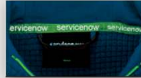
Private Neck Label