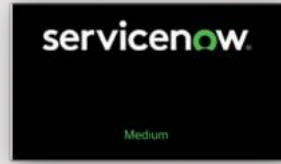
Custom Neck Taping