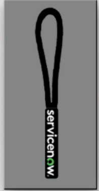
Custom Zipper Pull