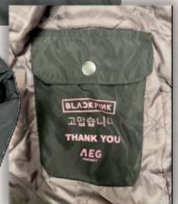
Screen Print Inside Pocket